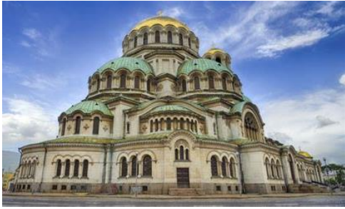
Sofia, Bulgaria is a city of contrasts and delights.

The next international meeting will be in Sofia Bulgari from the 7 th to 10 th of October 2020. We were there in 2016 and it is a fascinating city and the hotel and hospitality of their Grand Priory is superb. They are also hosting a Conference on the 6 th , entitled, OSMTH - Past, Present, and Future . If you are interested in attending, please let me know