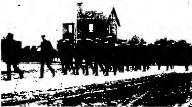
Firing party marching from armoury to the "Square" on May 20th, 1910. Blue uniform, white cap covers and brown waist belts. Officers with Sam Browne belts and swords.