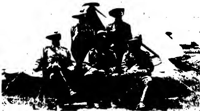
OFFICERS IN CAMP IN 1912

number of horses to well over a hundred. The harness was changed from the old type to the breast collar pattern, which was used up till the time mechanization took place and the horses dispensed with. The uniform was also changed. The blue breeches and trousers of the drivers and gunners were replaced by khaki bedford cord breeches with a narrow blue stripe down the sides. Khaki puttees took the place of the