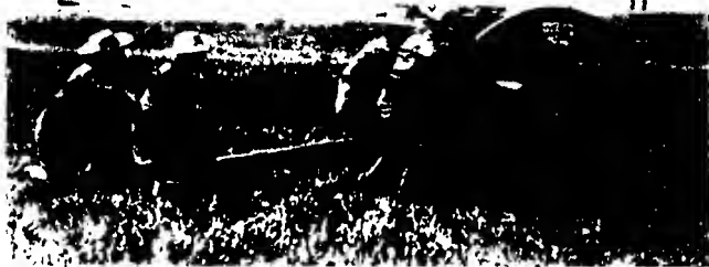
A 13 pr. Q. F. Mk. 1 in action.

This year the battery did sixteen days' training and as the ranges at Sarcee had been completed we did our first live shell practice. We now felt like real artillerymen, for we had done our complete training from soup to nuts. Before this year we