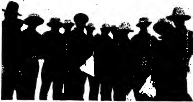
Group of drivers on Stable Parade. Evidently filling nose bags. The drill uniform is blue.

in camp, and was made up of blue cotton stuff. The difficulty with this blue drill outfit was that the dye had a great tendency to run. Straw hats were issued in camp and were turned up on one side after the Australian fashion. The cap badge was of brass or gilt metal, and was the well-known gun badge of the gunners. The word "CAN-ADA" was placed in the scroll above the gun instead of