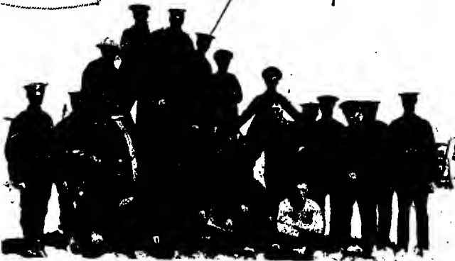
Group about a gun. On the left are a bombardier and driver with breeches, leggings and spurs. On the right are gunners with trousers and no spurs. Stripes were worn on the right arm only.

The uniform was blue, with scarlet facings. The cap was a blue naval pattern with scarlet cap band, and a scarlet piping at the edge of the crown. The jackets were blue, with scarlet collars and shoulder straps and a knot of yellow braid at the cuffs. There was also a strip of the same yellow braid at the base of the collar. The drivers wore blue cloth breeches with a broad scarlet stripe and black leather leggings and spurs. The gunners wore blue trousers with the same broad scarlet stripe, but no leggings or spurs. A brown leather waist belt was worn instead of the present-day bandolier. Sling belts