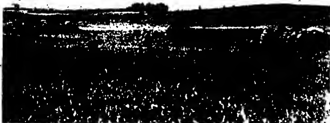
Battery in action behind the ridge which forms the background of picture. Near the crest are some of the B.C.'s party. The make-shift wagons have to be unhooked instead of being unlimbered, as was horse artillery practice

previous year at the Industrial School in East Calgary to a position near the reservoir southwest of Calgary. This camp had a few more luxuries in the way of latrines, ablution tables and water supply. Though the reservoir was well guarded by sentries and placed out of bounds to the troops, rumour was most persistent that it was a remarkably good place for swimming, particularly during the hot weather of the camp. There may or may not have been some truth in this rumour, but the next year the camp was moved away from the reservoir and close to the present situation of Sarcee Camp. The outstanding event of this camp was the Coronation Day parade on June 22nd, when all the troops took part in a parade through the streets of Calgary.