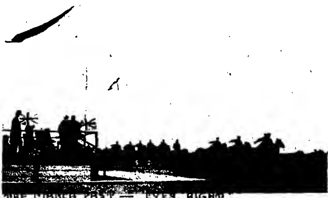
THE MARCH PAST — EYES RIGHT.

THE DUKE IS SECOND FROM THE RIGHT ON THE STAND.