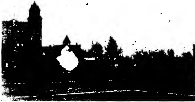
"Battery Fire, One Minute." Picture on the "Square", looking south-east.

piece of bald-headed prairie about ten acres in extent, situated in centre of the old townsite and was surrounded by a chain fence. Originally, I believe, it was designed as a place for turning the bull teams which did the freighting in the country in the early days. Later it was the place where games and athletic contests were held, and now it has been turned into a very beautiful park known as Galt Gardens. The guns were