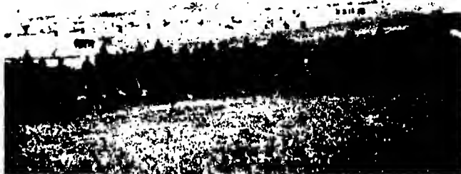
Battery in gun park on return from Coronation Day Parade in Calgary in 1911. Cavalry lines in background.

The battery left Lethbridge early in the morning in its special train of stock, flat and passenger cars, and after a tedious, long, hot and tiring trip, arrived in East Calgary in the late afternoon. After a lot of work the men, horses and vehicles were unloaded and hooked up, and we were ready to march to the camp site. When the order was given to mount, a commotion took place in one of the gun teams, and it shot out of line and streaked across the prairie at full gallop, minus one of the drivers who had been thrown in mounting. The gunners riding on the gun and limber thought it great sport to be travelling at that speed, and did not know what a dangerous predicament they were in. However, the runaway was brought under control before any serious damage was done. The driver was extremely lucky, because instead of being run