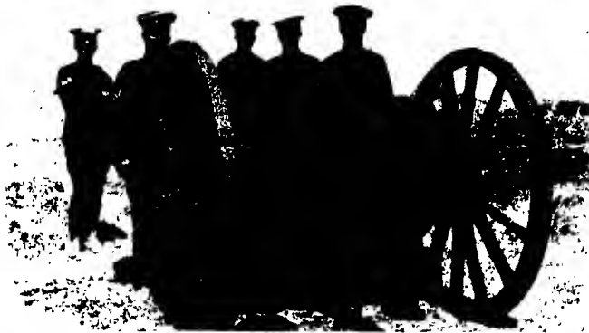
Battery sergeants grouped about a gun. Details of the 12 pr. Mk. 1 show up well, leather buckets and leather cover for the Scott sight bracket.

As there was no long recoil mechanism the shock of discharge was transmitted directly to the carriage, with the result that it jumped up in the air and dug the trail deep into the ground, or the carriage ran back if the ground was hard. To counteract this activity the carriage was fitted with a device known as a spade. This affair did look very much like an enlarged garden spade, and was hinged to the under side of the axle by what would correspond to the handle. The broad part of the spade engaged in the ground when lowered, and when travelling was hooked up to the underside of the trail by a spring catch. On coming into action this catch was released allowing the broad part of the spade to fall and engage in the ground. The braking force of the spade was transmitted to the carriage by two pieces of wire cable, and a spring enclosed in a steel housing in the trail.