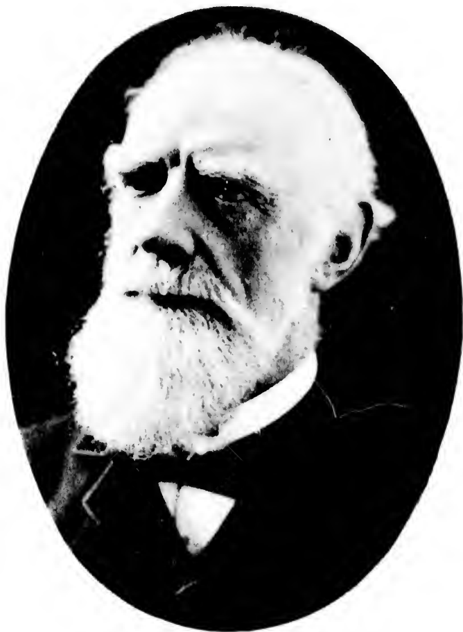
LORD STRATHCONA AND MOUNT ROYAL.