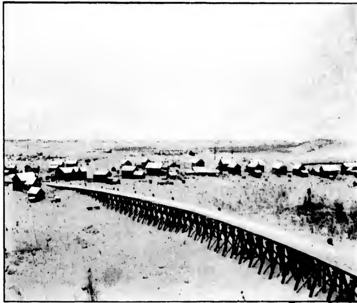
MINING TOWN A FEW MILES OUTSIDE SUDBURY.

allow it to pass out of their hands. (Loud cheers.) It was emblematical of everything that was good, the symbol of freedom throughout the world. They were carrying it into a war which was being waged for freedom and equal rights to all. (Cheers.) He wished the regiment Godspeed, and a safe return, and he was sure that they would do honour to themselves, and, in so doing would confer honour upon Canada. (Loud cheers.)