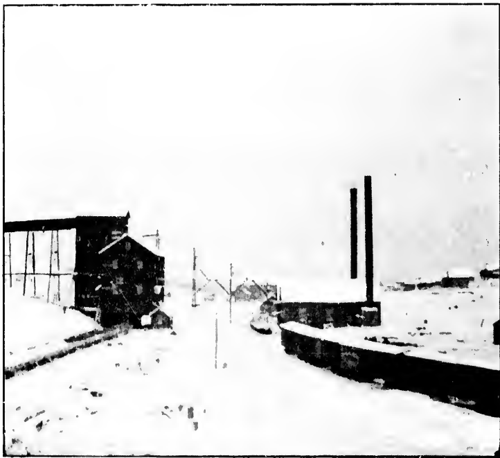
A SECTION OF THE SUDBURY MINES.

ownership in it as anybody else. It is a Hiberno-British Empire. (Cheers.) They have as good a right to enter its best rooms as anybody else. . . . I would say to you—' Never abandon Ireland, your country ; so long as there is one thing she ought to have—if you live in Ireland—struggle for it ; if you live here, give that struggle your moral support ; but do not deprive yourselves and your sons of your birth-right ; for there is no man, call he himself English or Scotch, who has a better right to walk into the best room in that building than you ?— . . . do not go and make yourselves aliens where you are sons of the house and can aspire to rule. (Cheers.) . . . The Empire is really a Brito-Hibernian Empire. (Cheers.)"— Ireland and the Empire, a Speech by Nicholas Flood Davin, delivered before the St. Patrick's Society of Montreal on St. Patrick's Day, 1885.