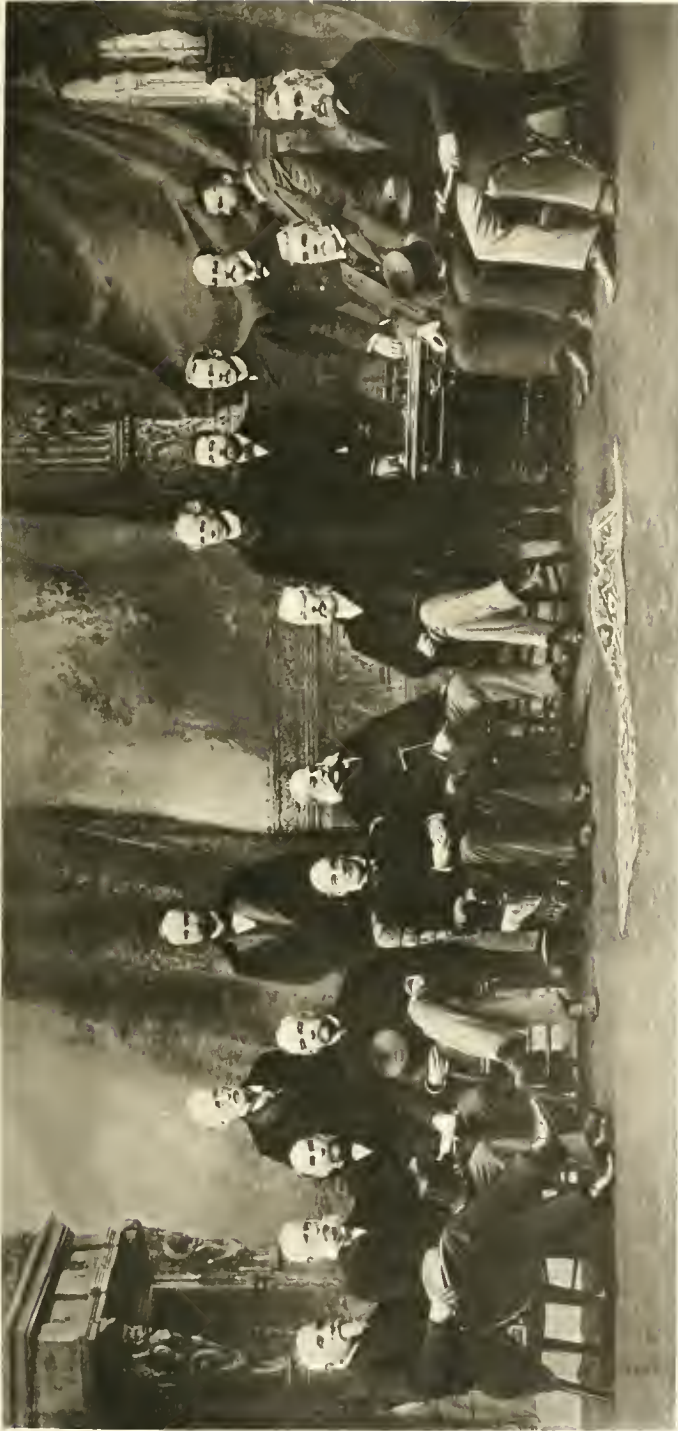
Генерал-адъютант — на 20-м