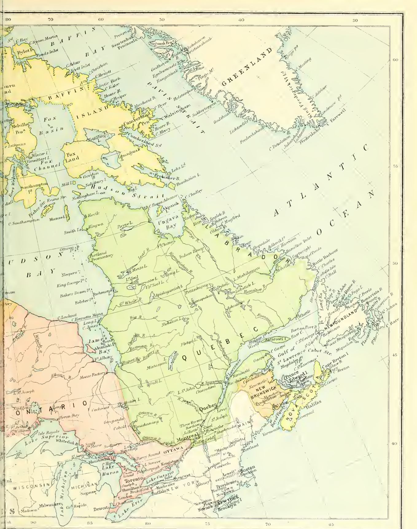
"Canada and Its Provinces."