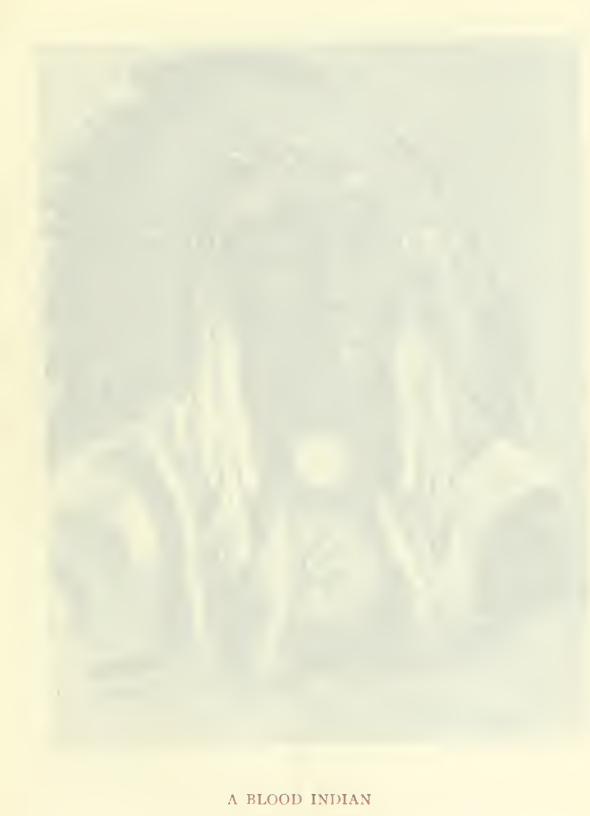
A BLOOD INDIAN From the painting by Edmund Morris