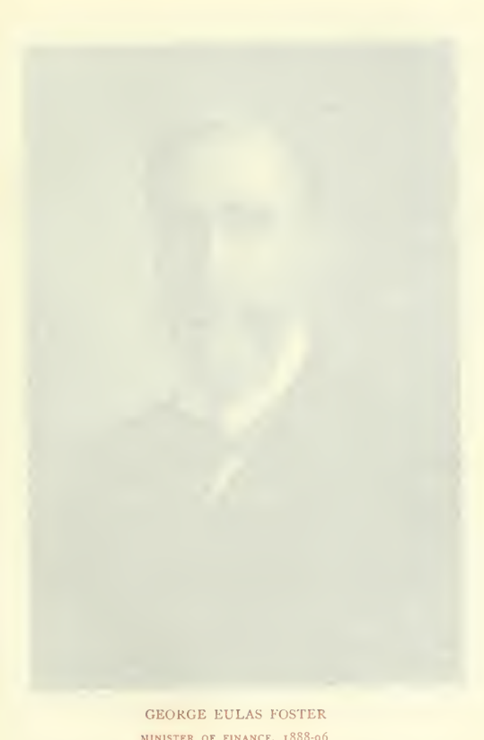
MINISTER OF FINANCE, 1888-96