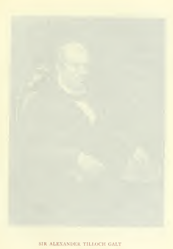
SIR ALEXANDER TILLOCH GALT FIRST FINANCE MINISTER OF THE DOMINION