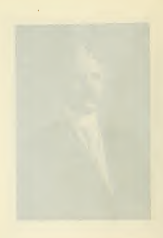
SIR ROBERT LAIRD BORDEN EIGHTH PRIME MINISTER OF THE DOMINION