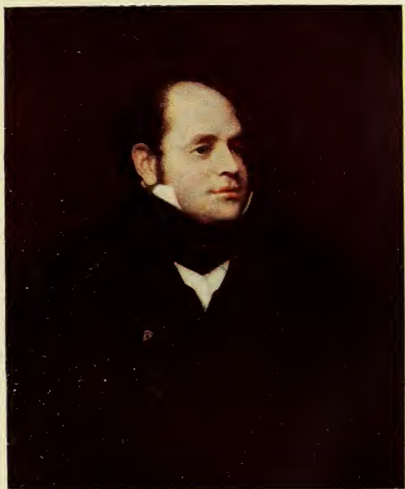
SIR JOHN FRANKLIN