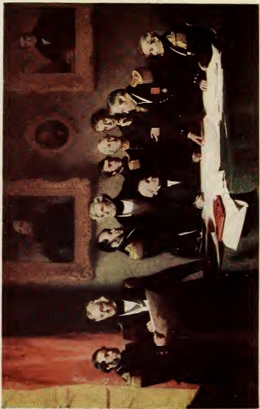
THE ARCTIC COUNCIL DISCUSSING A PLAN OF SEARCH FOR SIR JOHN FRANKLIN