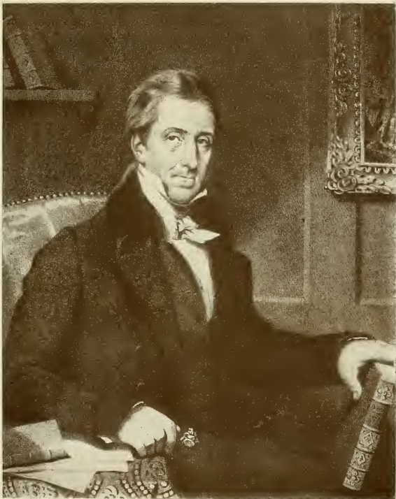
DENIS BENJAMIN VIGER

From a print in M'Gill University Library