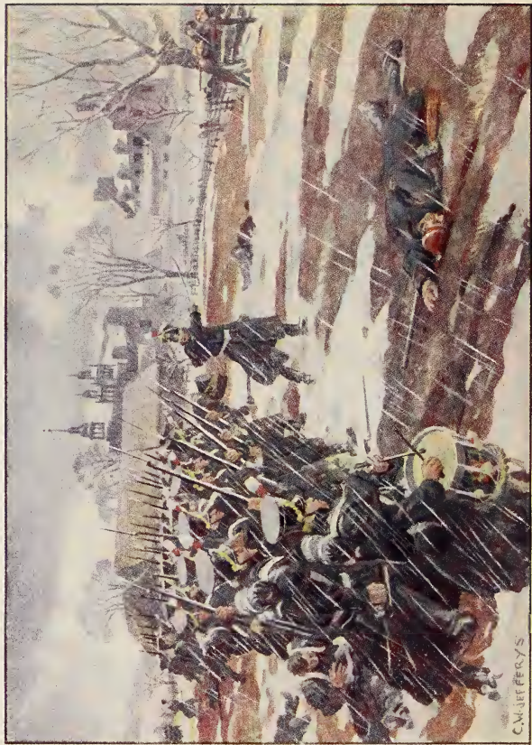
ADVANCE OF THE BRITISH TROOPS ON THE VILLAGE OF ST DENIS, 1837