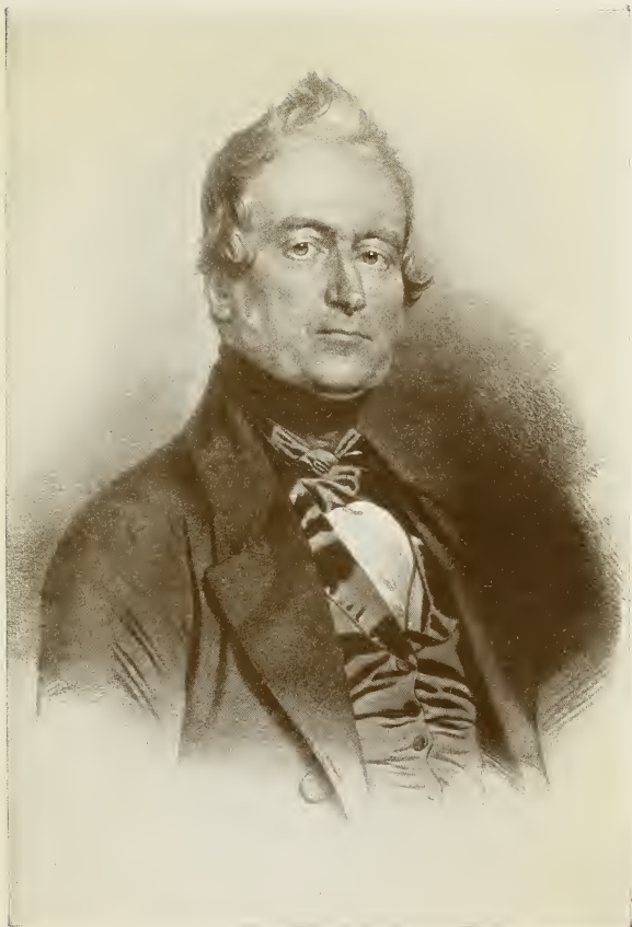
LOUIS JOSEPH PAPINEAU After a lithograph by Maurin, Paris