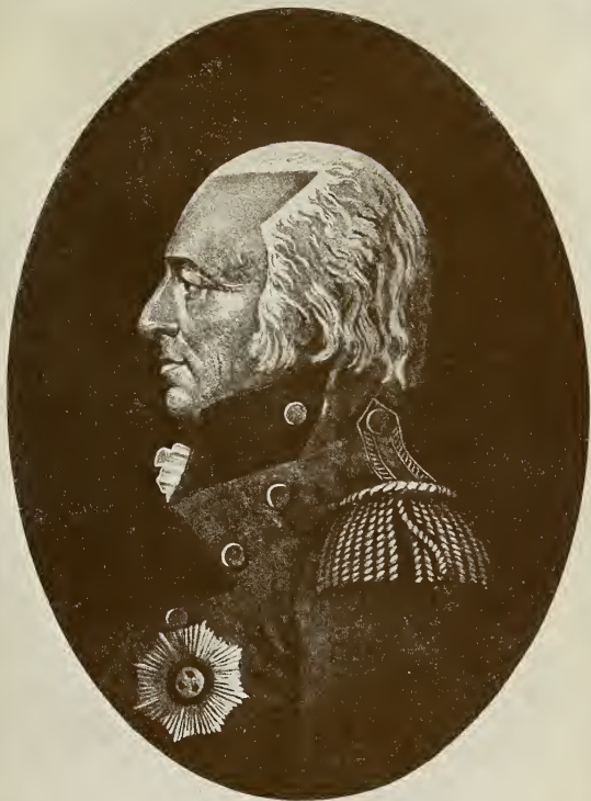
SIR JAMES CRAIG

From a portrait in the Dominion Archives