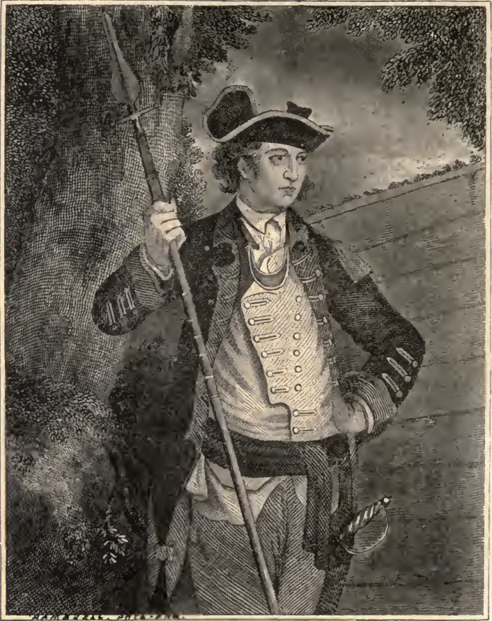
MAJOR GENERAL JOHN SULLIVAN.