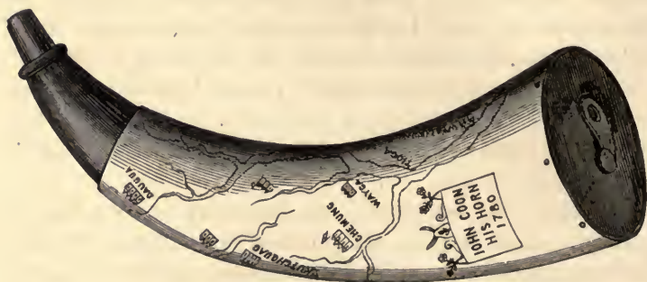
SULLIVAN'S ROUTE, AS TRACED ON A SOLDIER'S POWDER HORN.*

often waist deep. A fearless and determined foe, acquainted, as the Indians must have been, with the topography of the country, would have improved the opportunity thus afforded to harass and inflict loss upon the advancing army. That the Indians did not avail themselves of this opportunity to retaliate upon their persecutors only serves to show the utter demoralization caused by their defeat at Newtown.