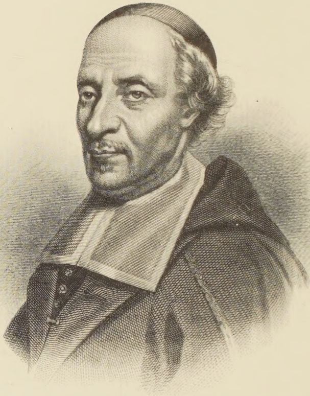
FRANCIS de LAVAL First Bishop of Quebec