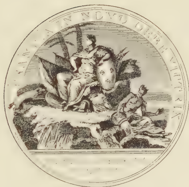
QUEBEC MEDAL OF LOUIS XIV