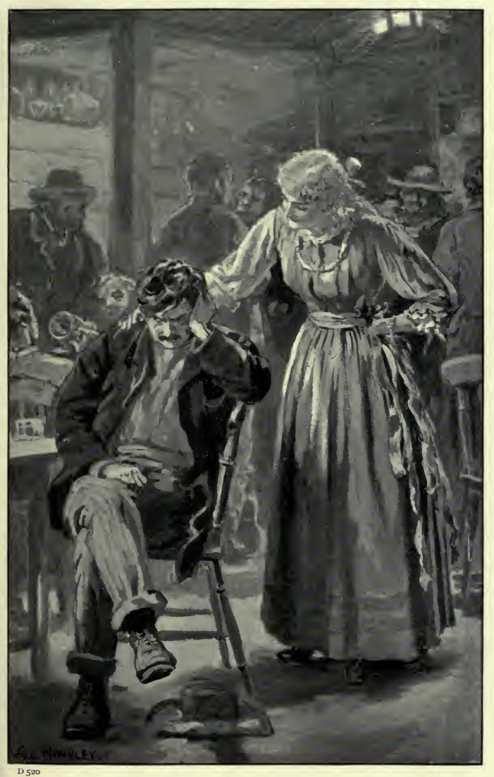
LILA ACCOSTS THE COLONEL IN THE DANCE-HOUSE