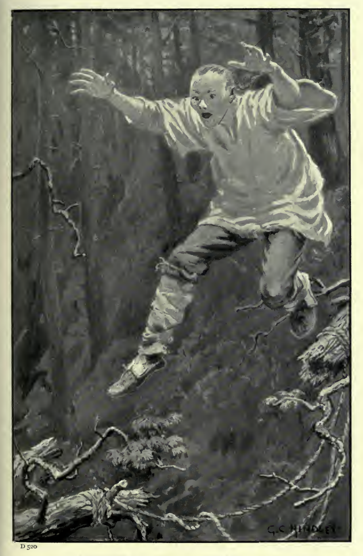
WITH A SCREAM OF FEAR THE CHINAMAN SPRANG OUT {\it Page}_{\,\,{\rm EIS}}