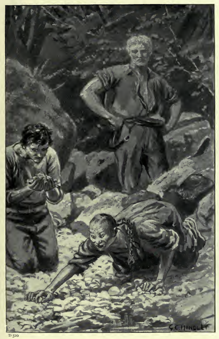
GOLD-GOLD IN FLAKES, AND LUMPS, AND NUGGETS