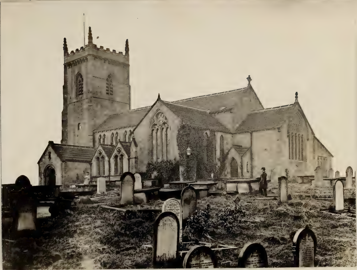
Guiseley Church (St Oswald's) Yorkshire England