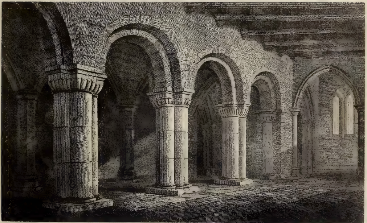
Choir of Guiseley Church Yorkshire England Photograph reproduced from an engraving 1865