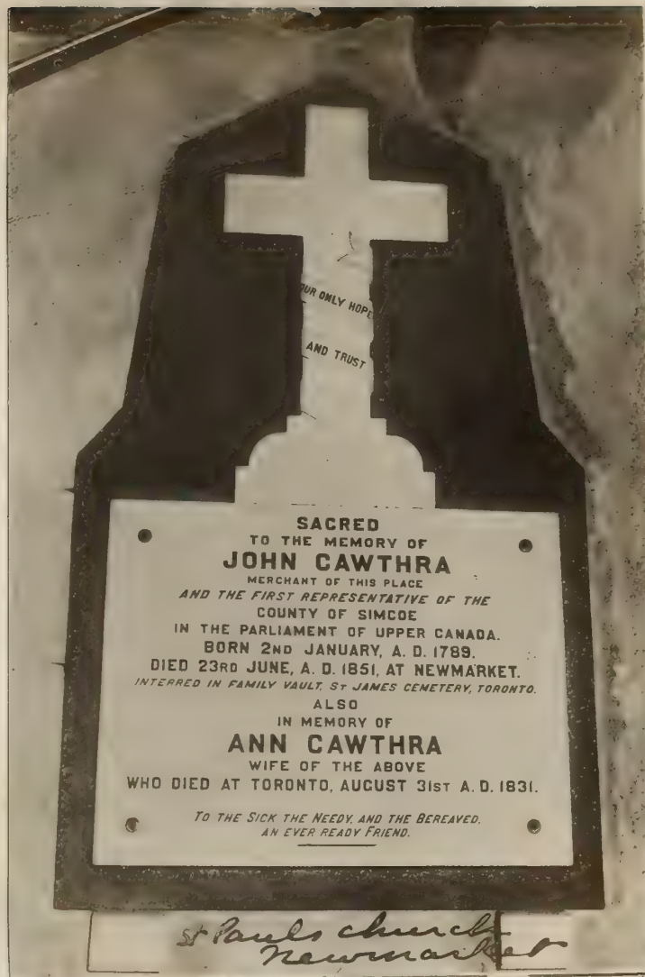
Memorial Tablet St Pauls Church Newmarket Canada