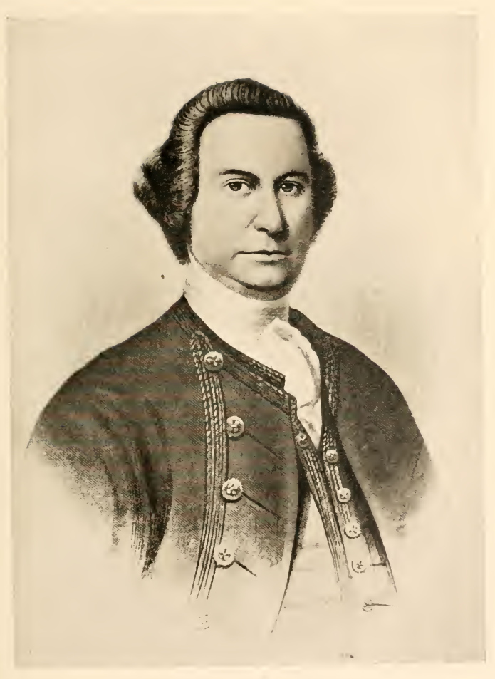
SIR WILLIAM JOHNSON From a contemporary engraving