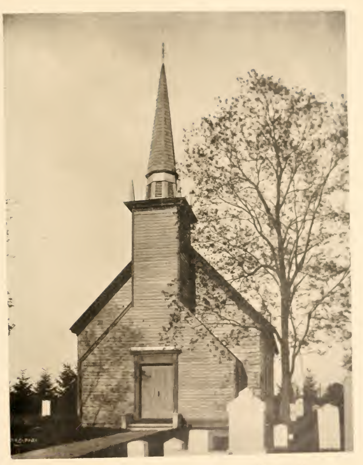
THE OLD MOHAWK CHURCH, GRAND RIVER