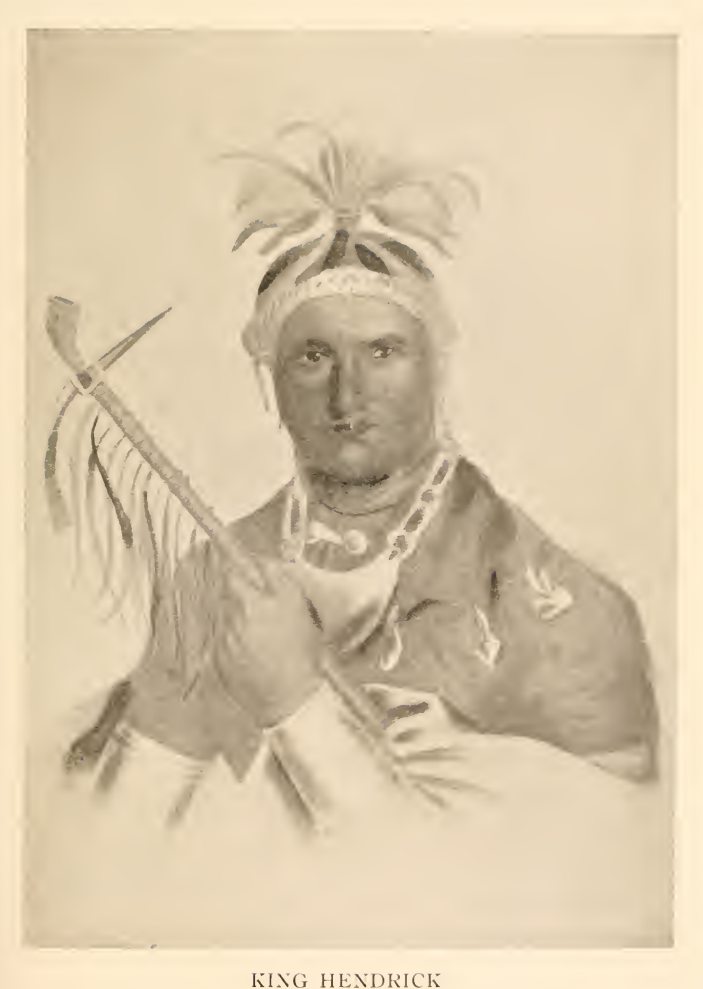
From a portrait in possession of the Chicago Historical Society