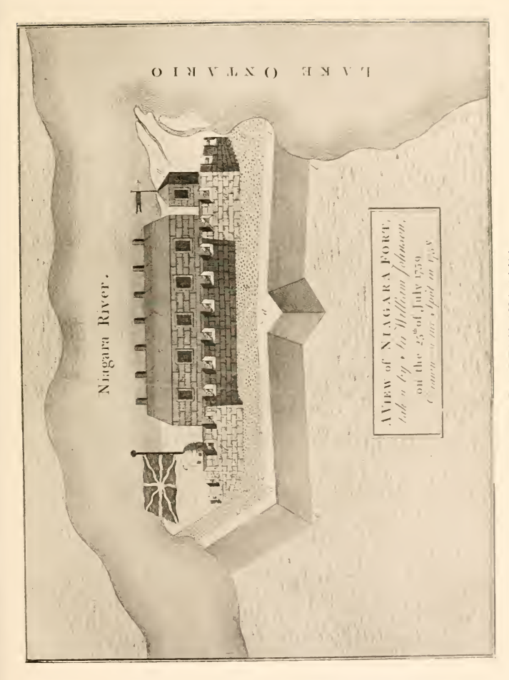
VIEW OF FORT NIAGARA