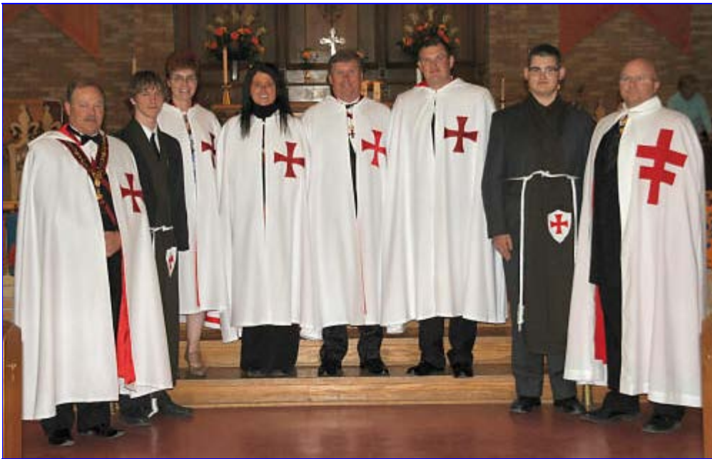
New Postulants and Paiges