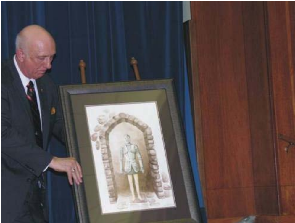
The Knight Before Christmas artwork.

Thank you to all who participated in this worthy effort!