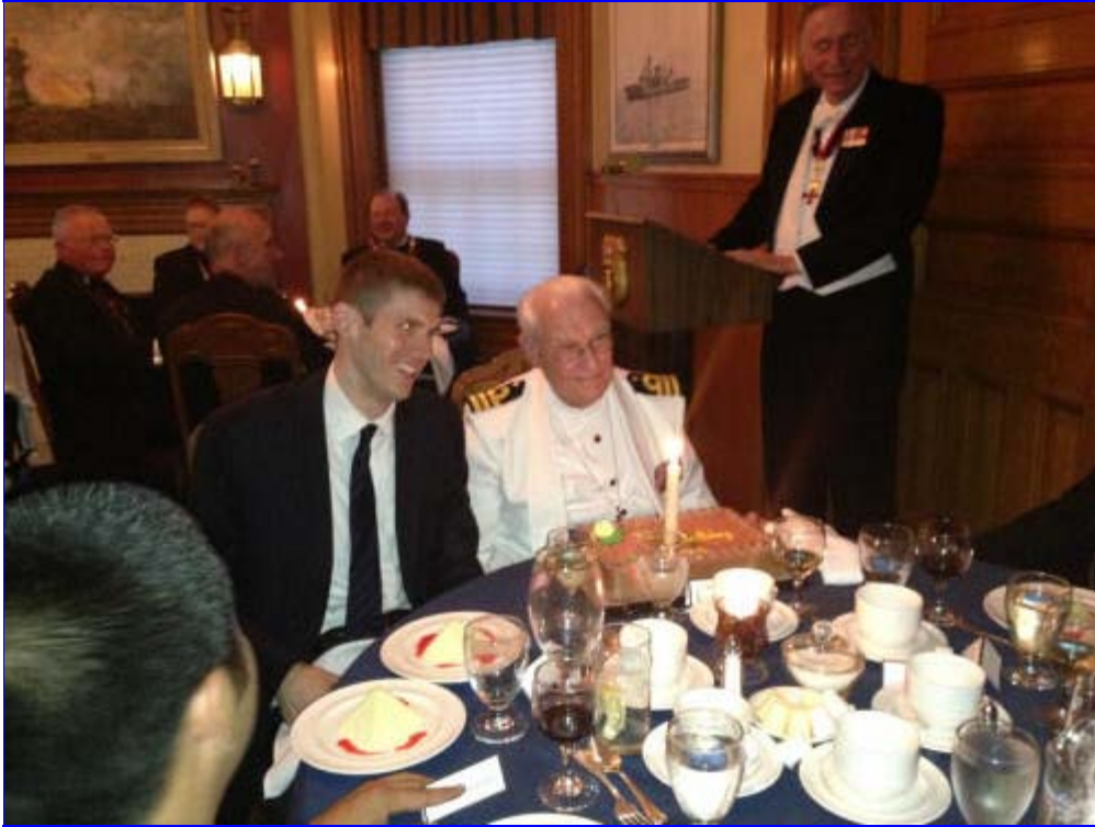
Celebrating the Vicar General's Birthday in Ottawa

We have recently contacted an organization called Project North that collects money to buy new hockey equipment for the same purpose in Nunavut, with a view to mutual cooperation. They do not handle used equipment at all, which means that we will not overlap with them, and this in turn means that meaningful cooperation will be possible.