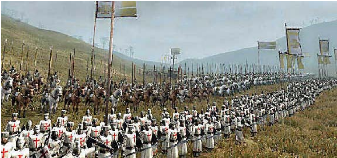
Our Grand Priory keeps expanding!