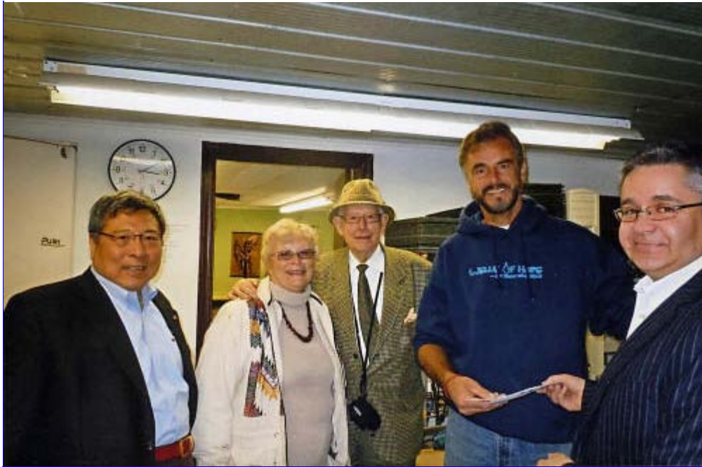
And here we are presenting our cheque