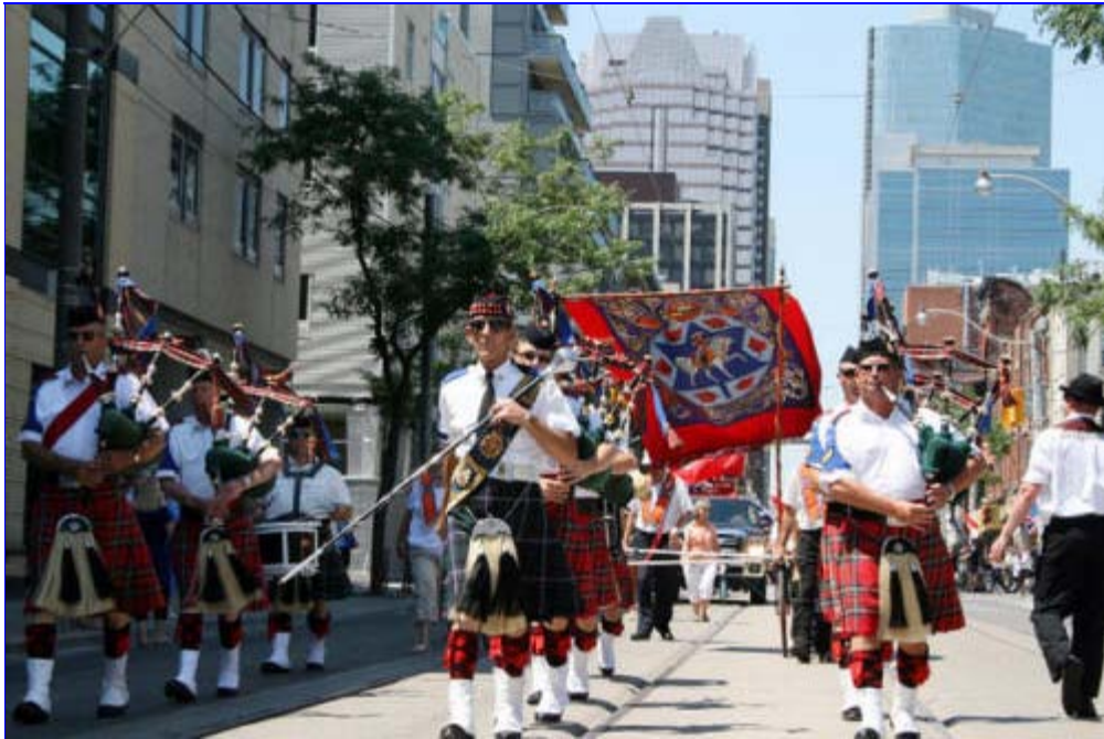
The 191st Annual Toronto Orange Parade marched along downtown streets on Saturday.

As they have done for decades, the Orange Lodge had their annual parade in July with a small number of marchers compared to their hay-day fifty years ago when they controlled City Hall and had their own newspaper: The Telegram.