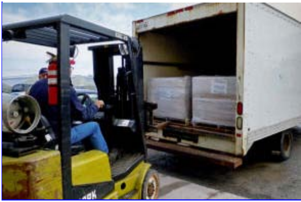
Donations coming in