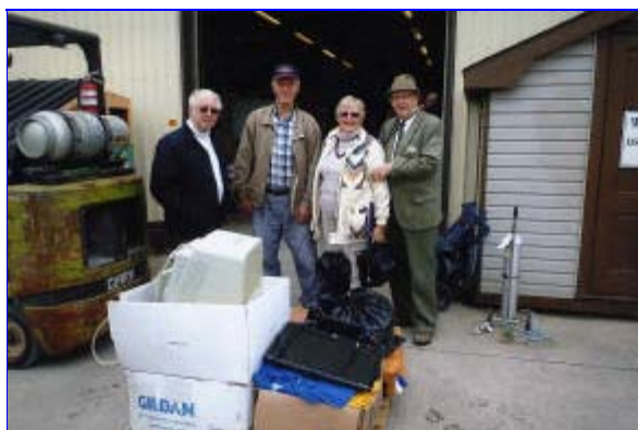
And our Priors own donation of shirts and computers