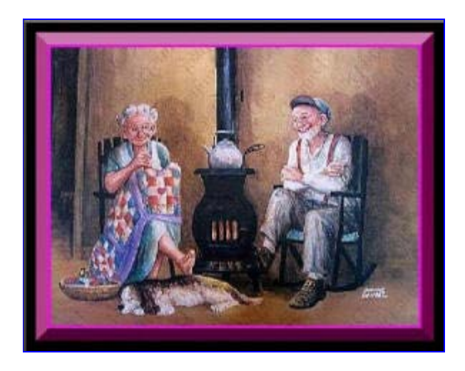
I was surprised, and asked him, 'And you still go every morning, even though she doesn't know who you are?'

He replied that she no longer knew who he was, that she had not recognized him in five years now.