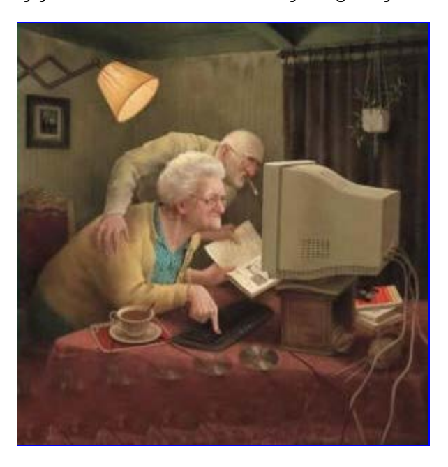
'Life isn't about how to survive the storm, But how to dance in the rain We are getting older but only one day at a time

The happiest people don't necessarily have the best of everything; they just make the best of everything they have.