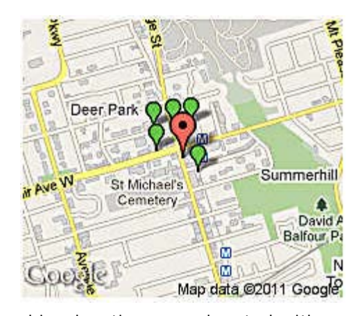
Green P parking locations are denoted with green markers

Annual General Meeting at La Passione, 1423 Yonge Street (at St Clair Avenue East), Toronto: just around the corner from the St Clair Subway stop.