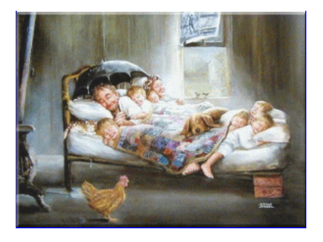
True love is an acceptance of all that is, has been, will be, and will not be.

The happiest people don't necessarily have the best of everything; they just make the best of everything they have.