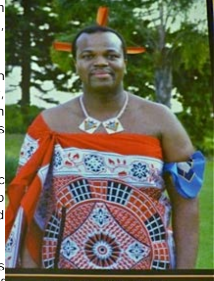
HIS MAJESTY KING MSWATI III NGWENYAMA OF THE KINGDOM OF ESWATIN / SWAZILAND

This is the land of the "flatdogs", otherwise known to us as "crocodiles". and cattle are the recognized "traffic lights" of the country.