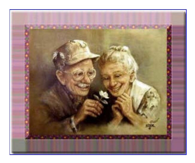
I had to hold back tears as he left, I had goose bumps on my arm, and thought,

He smiled as he patted my hand and said, 'She doesn't know me, but I still know who she is.'