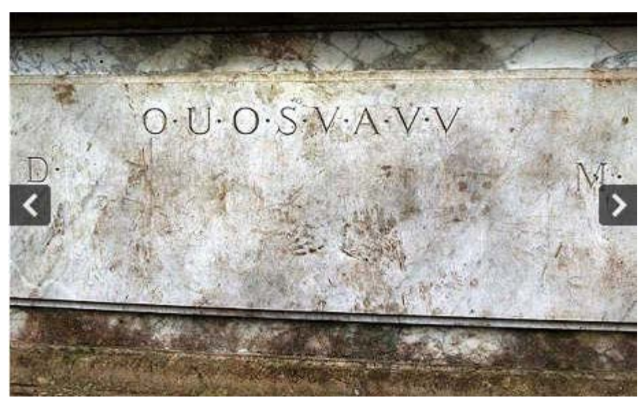
The eight-letter inscription on the Shepherd's Monument in Shugborough, Staffordshire

Explanations for the eight-letter inscription on the 18th century Shepherd's Monument, at Shugborough Hall in Staffordshire, have ranged from a coded love letter to Biblical verse.