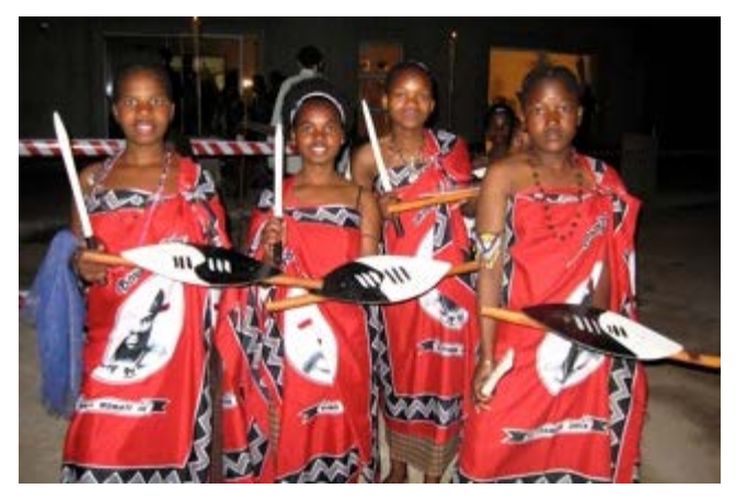
Bulembu Orphans at Canadian Tenors concert

the climate was quite cool during the night, early morning and evening.