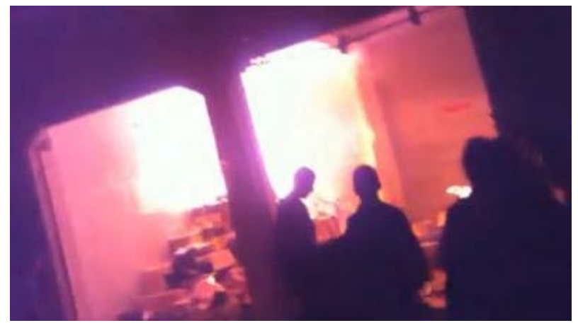
The image shown here, taken from a video posted online, is purported to show attacks on businesses in northern Iraq following a sermon Dec. 2. The authenticity of the video could not be verified.

Muslim mob subsequently tore through the streets to destroy not only a massage parlor but more than two-dozen other businesses. The mullah later denied responsibility for inciting violence in an interview with the Iraqi newspaper Rudaw.