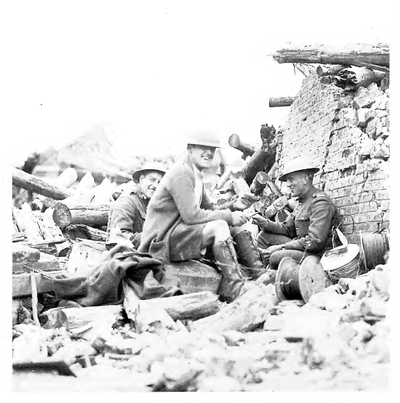
During a brief rest, Canadian Signallers enjoy a light moment resting beside an old German bunker near Lens, September 1918.

signalling in 1898 and, fruitlessly, suggested it for use in the Boer War.<sup>44</sup> Certainly, since the Russo-Japanese War of 1904-1905 it had been known that electric impulses could travel through the ground, allowing listening posts to intercept enemy communications. Early in the First World War it had occured to some on both sides that the same principle could be used to transmit messages without using cable; after some disappointing experiments, the British turned to the French, sending Captain Sir Henry Morgan, MP, to France.