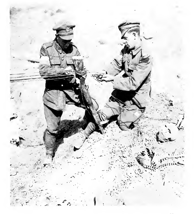
To keep wires off the ground Canadian Signallers use a German rifle as a telephone pole. September 1918. NAC PA 3100

office had a direct wireless link to the air reconnaissance unit so it could fire on German guns as soon as they were located.<sup>42</sup> While destroying trenches, gunners tried to get one observation aircraft for every one of their sixgun batteries.<sup>43</sup> All-in-all the Royal Flying Corps faced a wide variety of demands as a communications link between gunners and the front line at a time when air operations had become so hazardous the period was later called "Bloody April."