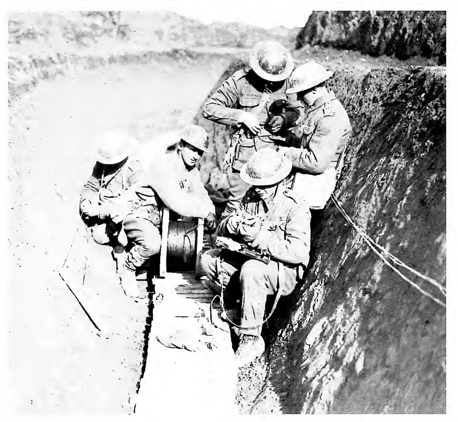
Repairing wire in a communication trench, February 1918.

the fact that they tended to leak acid on the unfortunate soldiers that carried them. Sources of interference were legion: disused railway tracks, pipe lines, buried cables or other metallic objects could interfere with transmissions, as could telephones. Further, power buzzers did not eliminate cable entirely, and the transmission station required a base line of 150 to 200 yards of wire, rendering it vulnerable to shell fire.<sup>71</sup> Wireless sets suffered from a similar problem, their weight aggravated by the need to set up conspicuous aerials; and they were powered by accumulators that needed recharging, a logistical problem not entirely solved in the days after Vimy, as the process could only be done at Corps headquarters, and an already complicated and strained transportation network could not always deliver fresh accumulators to forward stations.<sup>72</sup> Pigeons were uncertain, though runners were reliable. Currie suggested that "It would seem advisable to concentrate on telephonic, visual and runner communication, wireless being used as a subsidiary means of communication."73