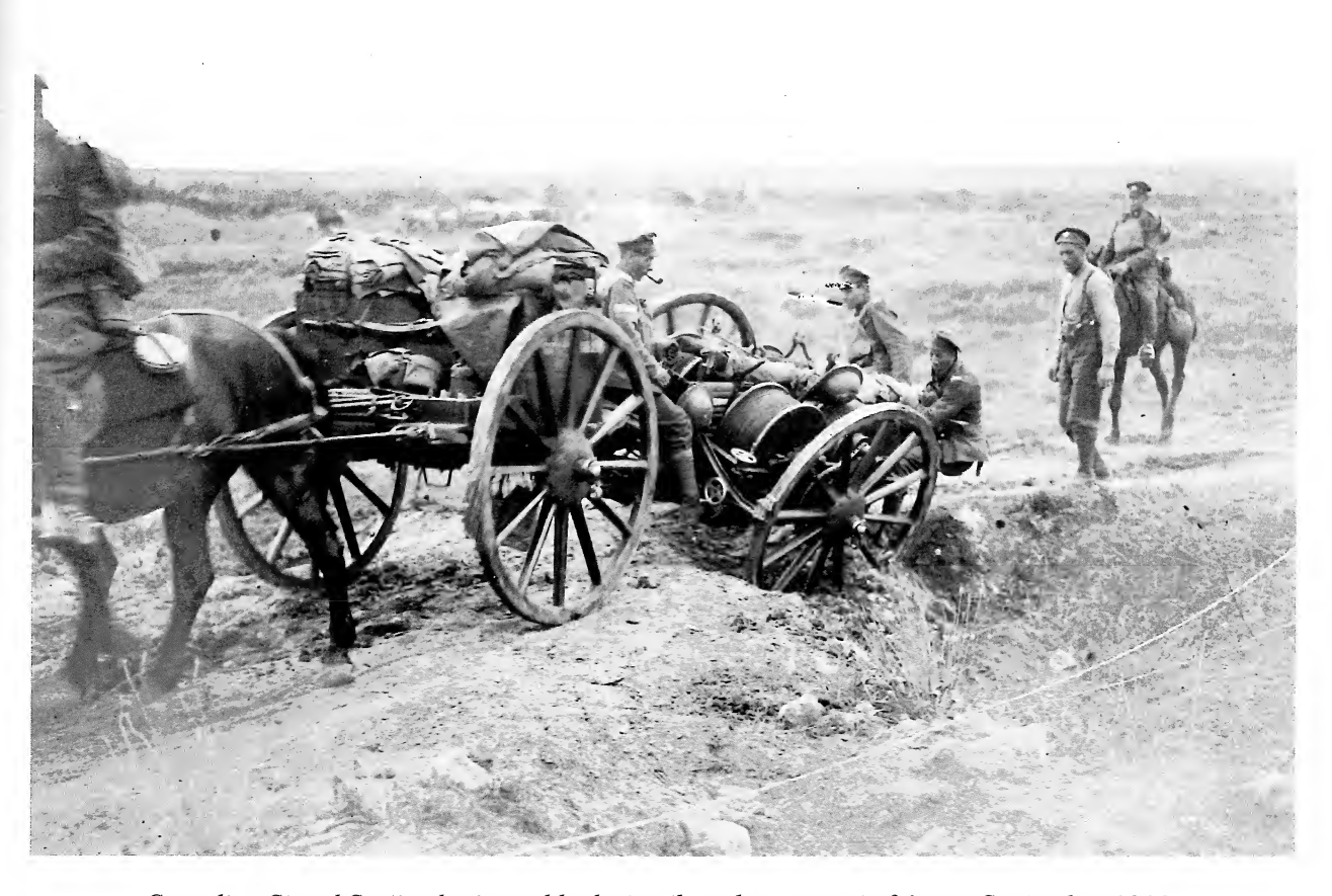
Canadian Signal Section laying cable during the advance east of Arras, September 1918.

also saw the use of the Sterling wireless set in aircraft. Its transmission range of eight to ten miles was a two-fold improvement over previous sets, and though the plane trailed a 120-foot copper antenna weighted with a lead plumb, this does not seem to have affected performance.<sup>19</sup> The main advantage the new set offered was to allow the observer to retake his place, for by early 1916 he, and not a lone pilot, operated the wireless, though there was still no room for a receiver.<sup>20</sup> The new arrangement greatly eased artillery spotting, and was easy for higher authority to accept as security was not an important factor in calling fall of shot: for the information transmitted to batteries was obsolete before the Germans could make any use of it.