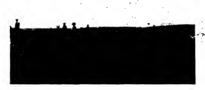
A sub-section on mounted parade in camp. Four-horse teams, old type harness, and 12 pr. Mk. 1, with gunners mounted on vehicles, training uniform with straw hats.

Perhaps it might be interesting to give some details of the organization, uniform and equipment of the field battery of thirty odd years ago. The Canadian field batteries were four gun batteries, with an establishment of four officers, to which supernumerary officers were added. A major commanded the battery, a captain was the second in command, and quartermaster, while each of the two sections was commanded by a lieutenant. Most of the batteries were brigaded into brigades of two or three batteries, but there were four or five unbrigaded or so alled "independent" batteries. As the 25th belonged to this atterigroup a medical officer, a veterinary officer, and a chaplain were also added to the establishment.