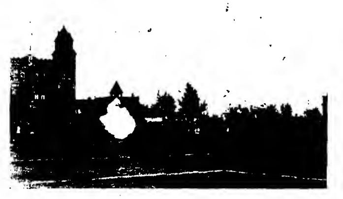
"Battery Fire, One Minute." Picture on the "Square", looking south-east.

piece of bald-headed prairie about ten acres in extent, situated in centre of the old townsite and was surrounded by a chain fence. Originally, I believe, it was designed as a place for turning the bull teams which did the freighting in the country in the early days. Later it was the place where games and athletic contests were held, and now it has been turned into a very beautiful park known as Galt Gardens. The guns were