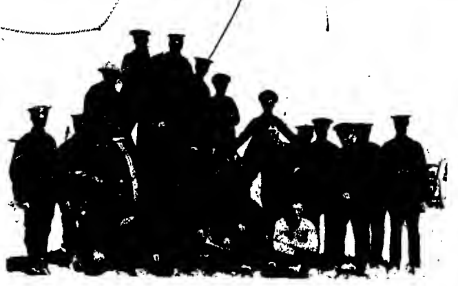
Group about a gun. On the left are a bombardier and driver with breeches, leggings and spurs. On the right are gunners with trousers and no spurs. Stripes were worn on the right arm only.

The uniform was blue, with scarlet facings. The cap was a blue naval pattern with scarlet cap band, and a scarlet piping at the edge of the crown. The jackets were blue, with scarlet collars and shoulder straps and a knot of yellow braid at the cuffs. There was also a strip of the same yellow braid at the base of the collar. The drivers were blue cloth breeches with a broad scarlet stripe and black leather leggings and spurs. The gunners were blue trousers with the same broad scarlet stripe, but no leggings or spurs. A brown leather waist belt was worn instead of the present-day bandolier. Sling belts