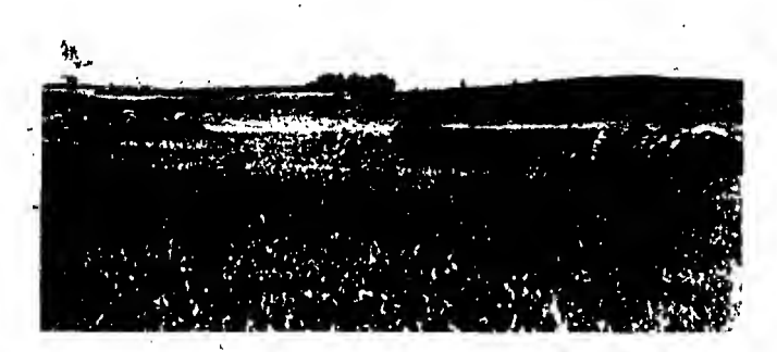
Báttery in action behind the ridge which forms the background of picture. Near the crest are some of the B.C.'s party. The make-shift wagons have to be unhooked instead of being unlimbered, as was horse artillery practice

previous year at the Industrial School in East Calgary to a position near the reservoir southwest of Calgary. This camp had a few more luxuries in the way of latrines, ablution tables and water supply. Though the reservoir was well guarded by sentries and placed out of bounds to the troops, rumour was most persistent that it was a remarkably good place for swimming, particularly during the hot weather of the camp. There may or may not have been some truth in this rumour, but the next year the camp, was moved away from the reservoir and close to the present situation of Sarcee Camp. The outstanding event of this camp was the Coronation Day parade on June 22nd, when all the troops took part in a parade through the streets of Calgary.