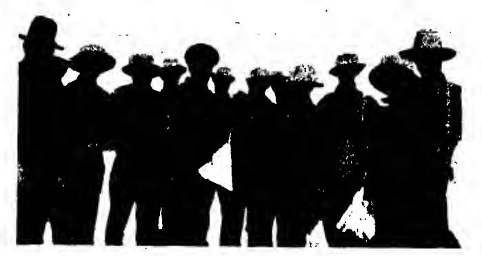
Group of drivers on Stable Parade. Evidently filling nose bags. The drill uniform is blue.

in camp, and was made up of blue cotton stuff. The difficulty with this blue drill outfit was that the dye had a great tendency to run. Straw hats were issued in camp and were turned up on one side after the Australian fashion. The cap badge was of brass or gilt metal, and was the well-known gun badge of the gunners. The word "CAN-ADA" was placed in the scroll above the gun instead of