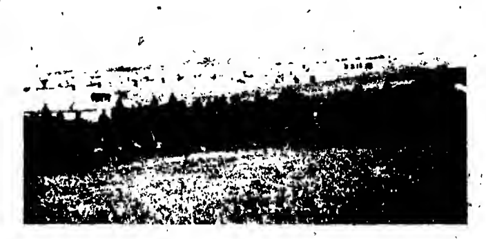
Battery in gun park on return from Coronation Day Parade in Calgary in 1911. Cavalry lines in background.

The battery left Lethbridge early in the morning in its special train of stock, flat and passenger cars, and after a tedious, long, hot and tiring trip, arrived in East Calgary in the late afternoon. After a lot of work the men, horses and vehicles were unloaded and hooked up, and we were ready to march to the camp site. When the order was given to mount, a commotion took place in one of the gun teams, and it shot out of line and streaked across the prairie at full gallop, minus one of the drivers who had been thrown in mounting. The gunners riding on the gun and limber thought it great sport to be travelling at that speed, and did not know what a dangerous predicament they were in. However, the runaway was brought under control before any serious damage was done. The driver was extremely lucky because instead of being run