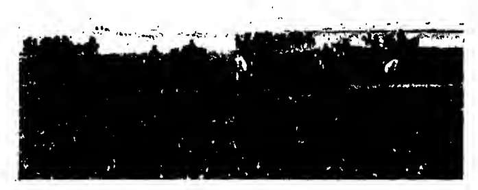
Mounted parade. Here the battery is halted in line with "Detachments Rear". The six-horse teams and the make-shift limbers for the wagons can easily be seen. In the background are the tents of the camp.

THIS TITLE SHOULD BE UNDER CUT ON NEXT PAGE.