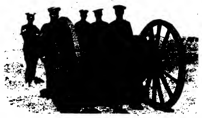
Battery sergeants grouped about a gun. Details of the 12 pr. Mk. 1 show up well, leather buckets and leather cover for the Scott sight bracket.

As there was no long recoil mechanism the shock of discharge was transmitted directly to the carriage, with the result that it jumped up in the air and dug the trail deep into the ground, or the carriage ran back if the ground was hard. To counteract this activity the carriage was fitted with a device known as a spade. This affair did look very much like an enlarged garden spade, and was hinged to the under side of the axle by what would correspond to the handle. The broad part of the spade engaged in the ground when lowered, and when travelling was hooked up to the underside of the trail by a spring catch. On coming into action this catch was released allowing the broad part of the spade to fall and engage in the ground. The braking force of the spade was transmitted to the carriage by two pieces of wire cable, and a spring enclosed in a steel housing in the trail.