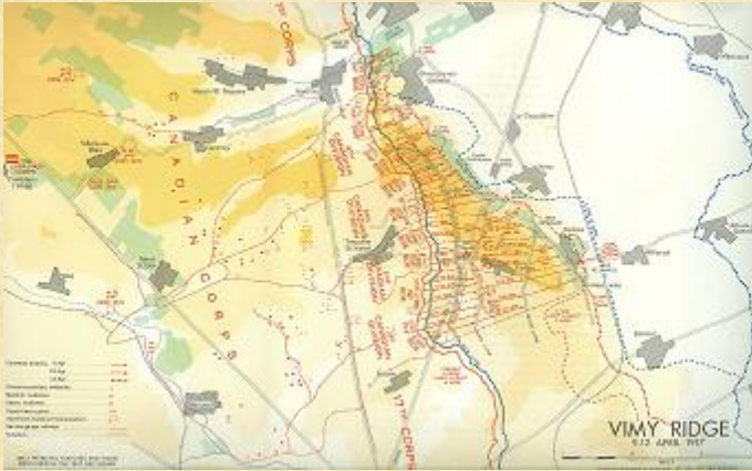
Attack on Vimy Ridge, April 1917 Official History of the Canadian Army Col. G. W. L. Nicholson, National Defence, 1962

To read more about the Battle of Vimy Ridge, we also welcome you to read the detailed text of battle and see the maps that outline where the units were on that frightful day in 1917, as depicted by Colonel G. W. L. Nicholson, C.D. of the Department of National Defense, Army Historical Section.