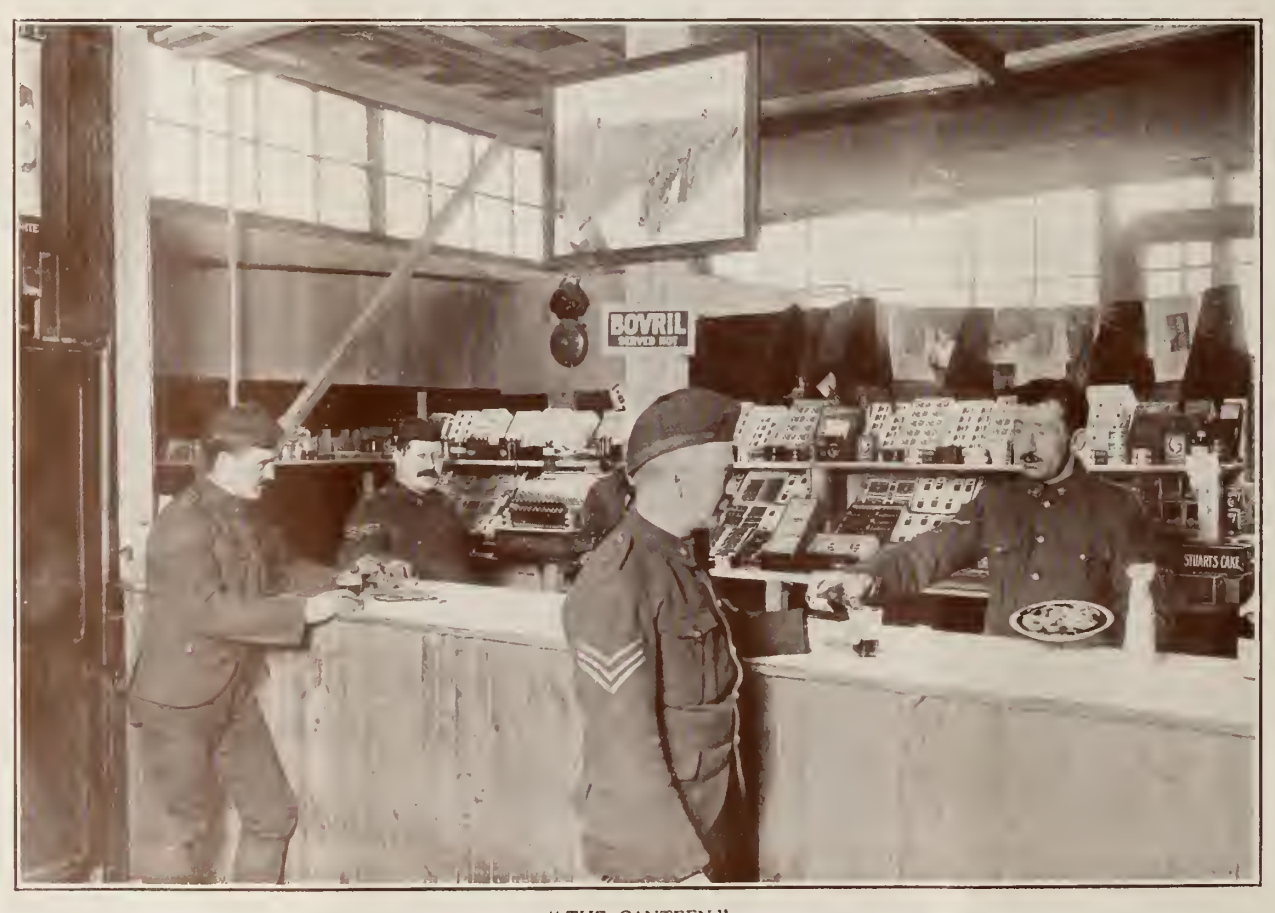
"THE CANTEEN" The Sergt, in the foreground is getting a drink, Perhaps it's not the kind he would prefer, but it has to do.