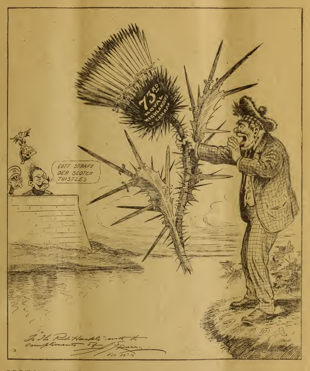
SCOTCH CANADA: Hi there, ye wallopin' wombat o' a clashmacloot! Here's anither wee bit thustle fer ye! Try an' sit doon on it mon! Just try!