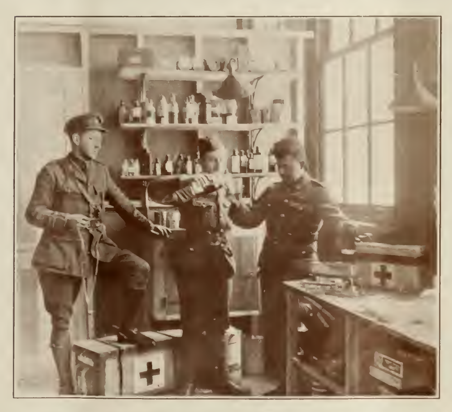
The only way the Editor could possibly "Ring In". He's the man with the Glass, not the "man with the Bottle