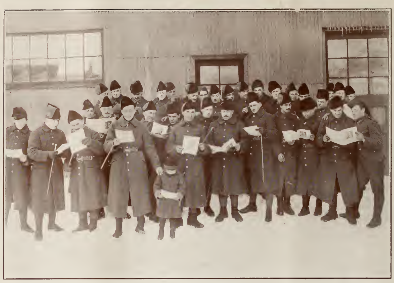
"HAVING A LAUGH" Reading the Red Hackle. They enjoy it, we hope you will,