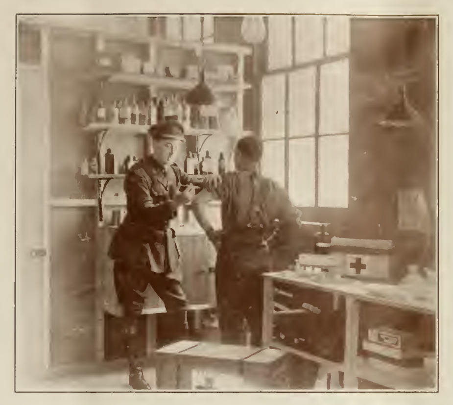
"Being Innoculated" against disease and "German Pest"