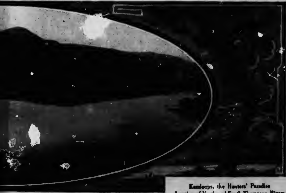
Kamloops, the Hunters' Paradise Junction of North and South Thompson Rivers

To mention any resort in particular, however, seems almost invidious, yet Fish Lake has some undoubted