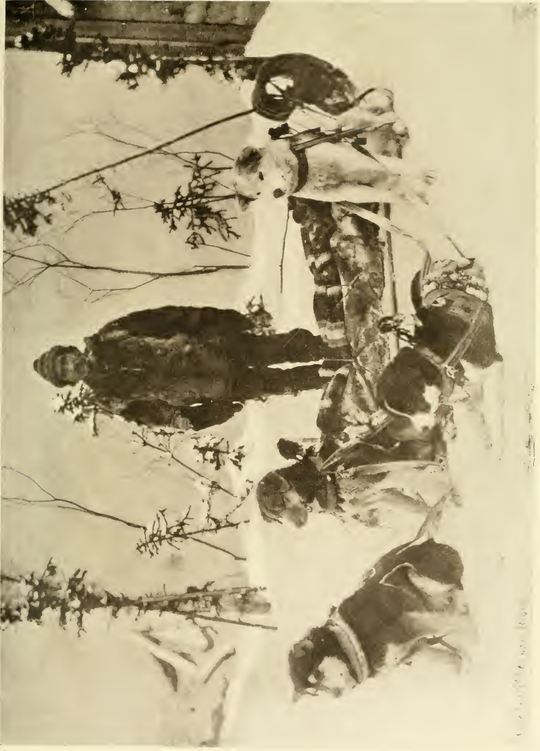
A FUR TRADER OF THE FAR NORTH