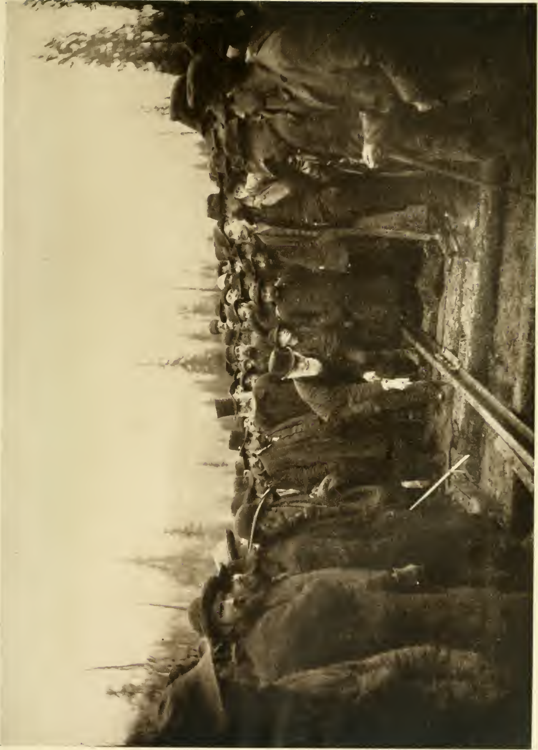
DRIVING THE LAST SPIKE OF THE CANADIAN PACIFIC RAILWAY AT CRAIGELLACHIE, NOVEMBER 7, 1885