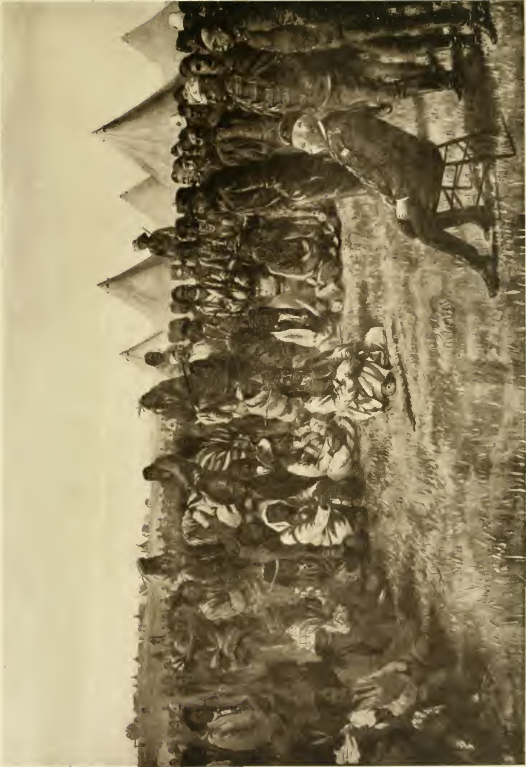
THE SURRENDER OF POUNDMAKER TO MAJOR-GENERAL MIDDLETON AT BATTLEFORD, MAY 26, 1885