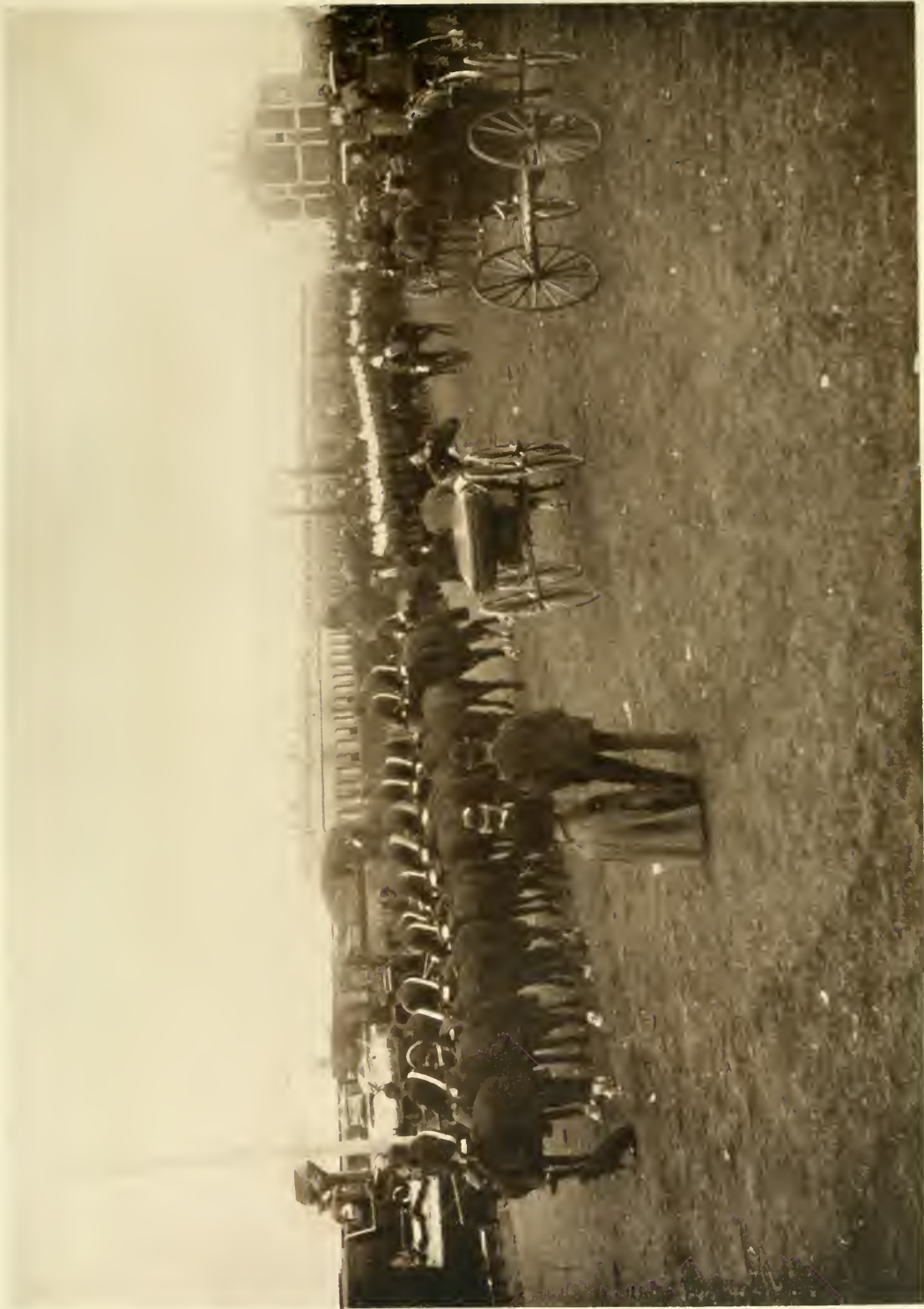
THE FIRST THROUGH PASSENGER TRAIN FROM MONTREAL ARRIVING AT CALGARY, 1886