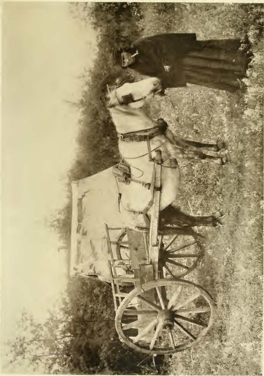
A RED RIVER CART AND DRIVER