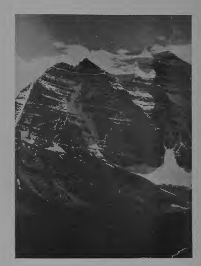
HE RAN AWAY WEST TO THE GREAT MOUNTAINS. To face page 187.