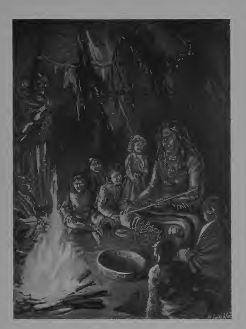
WITH THE CHILDREN CUDDLED AROUND, SOUWANAS BEGAN. To face page 22.