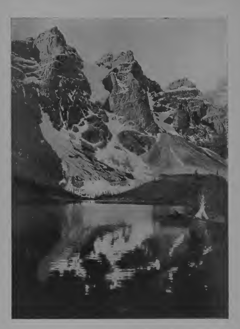
THE BEAUTIFUL REFLECTIONS IN THE WATER. To face have 77.