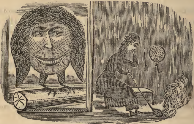
FLYING HEAD AND WOMAN SITTING BY THE FIRE.

I will now relate a few of the monsters that plagued them : The first enemy that appeared to question their power or disturb their peace was the fearful phenomenon of Ko-nea-rah-yah-neh, or the flying heads. The heads were enveloped in beard and hair, flaming like fire ; they were of monstrous size, and shot through the air with the speed of meteors. Human power was not adequate to cope with them. The priests pronounced them a flowing power of some mysterious influence, and it remained with the priests alone to expel them by their magic power.