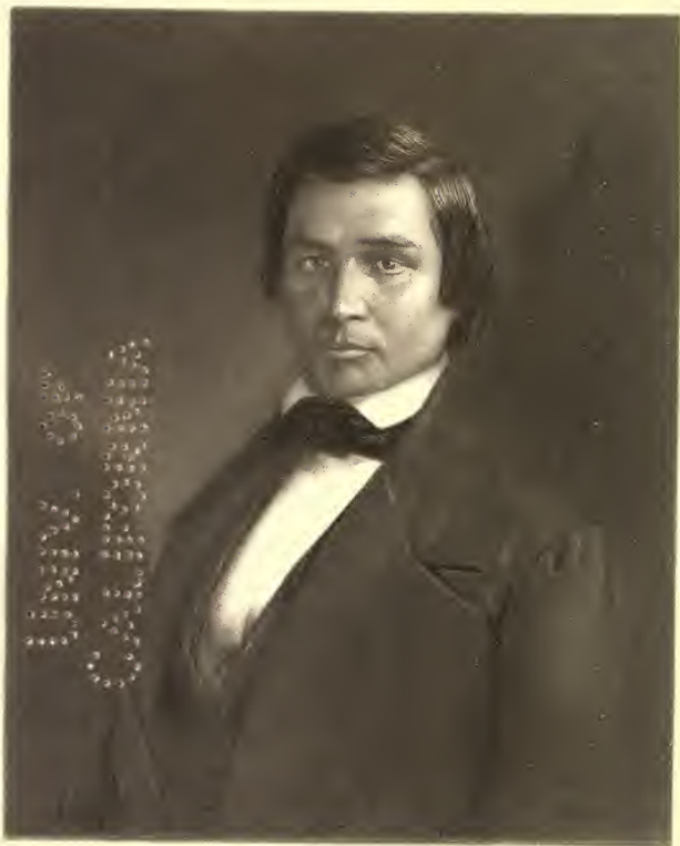
Portrait of a man in a dark suit and bow tie, holding a long, beaded necklace.