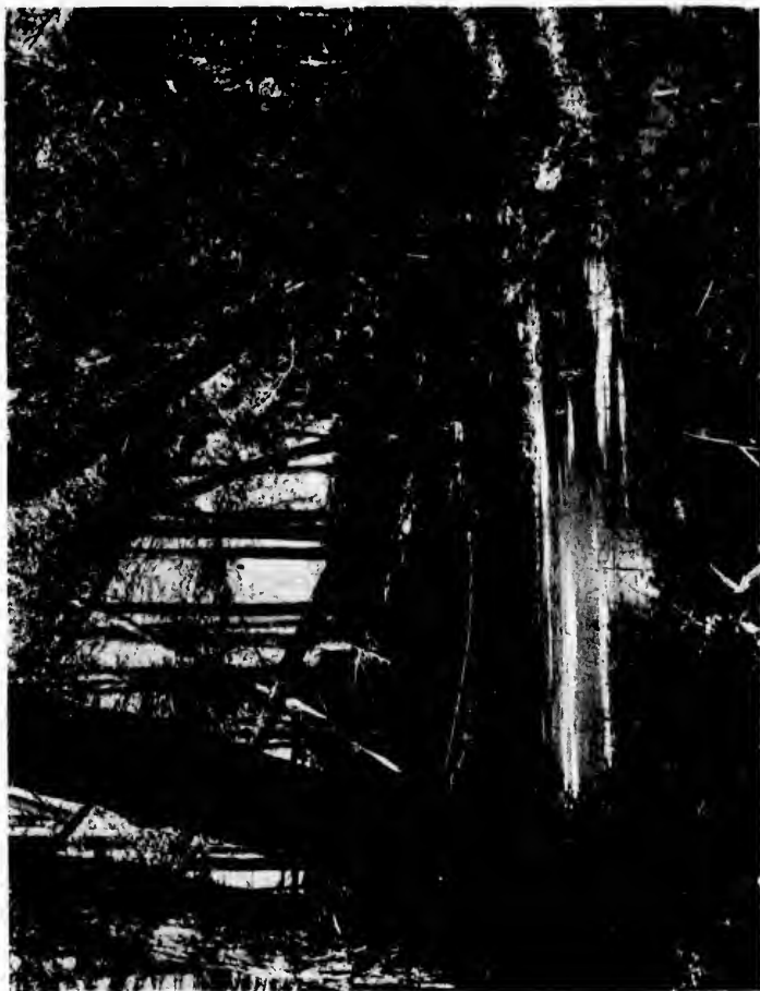
THE PIPER'S POND.