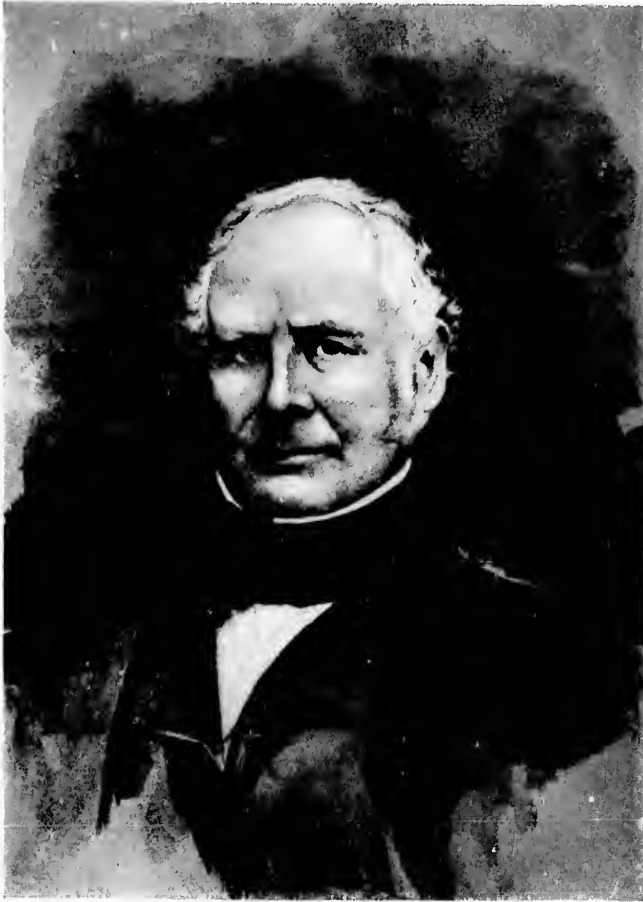
AGE, ABOUT 45.