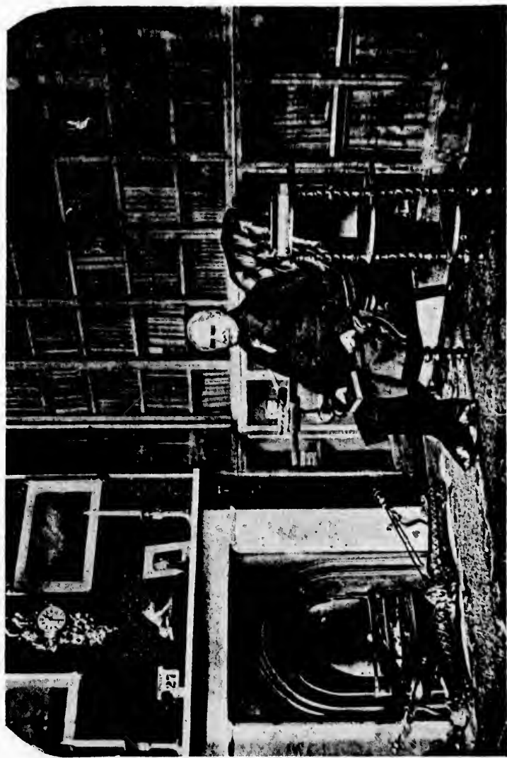
LIBRARY, GORDON HOUSE, ISLEWORTH.