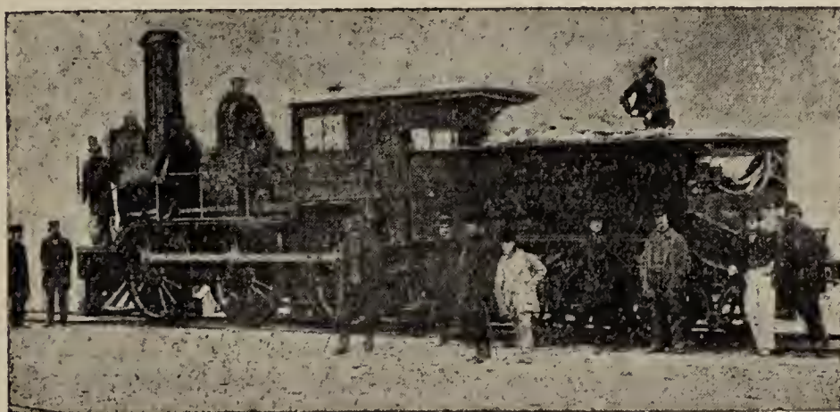
THE FIRST LOCOMOTIVE, 1853