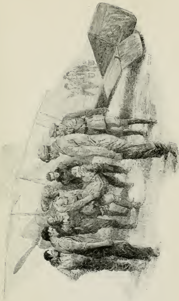
“She’s not dead?” I asked in a breath