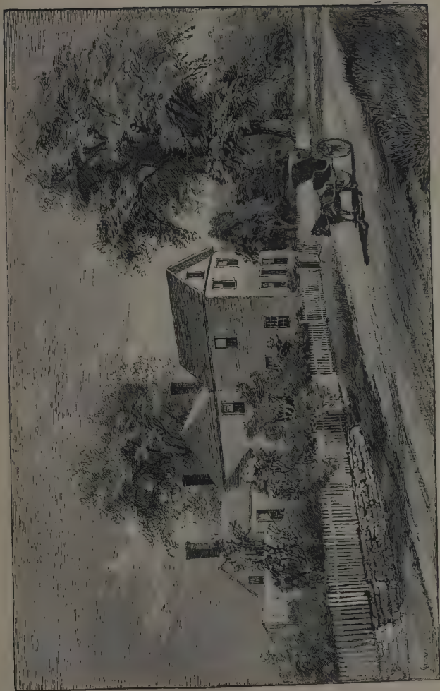
BIRTHPLACE AT LITCHFIELD, CONNECTICUT.