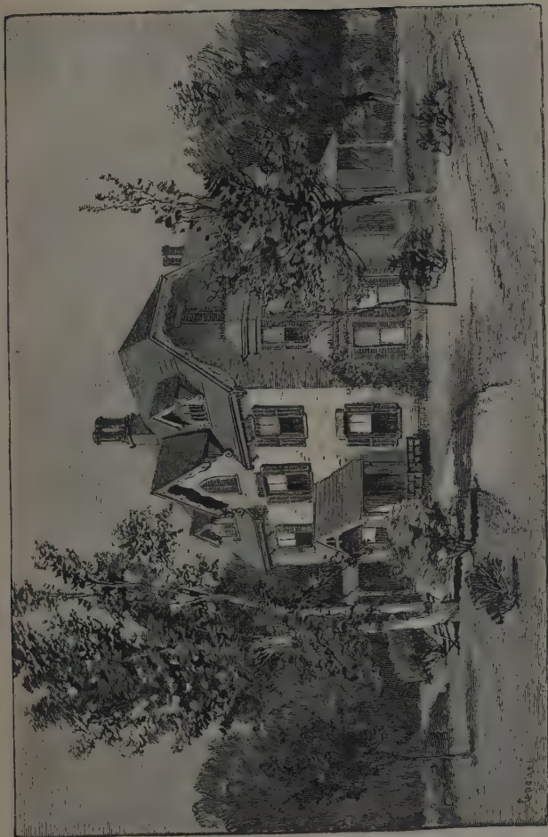
THE LATER HARTFORD HOME.