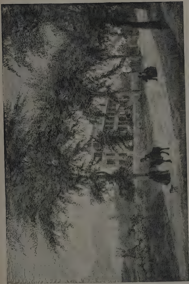
THE ANDOVER HOME