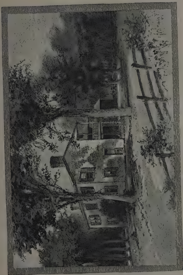
THE HOME AT WALNUT HILLS, CINCINNATI.