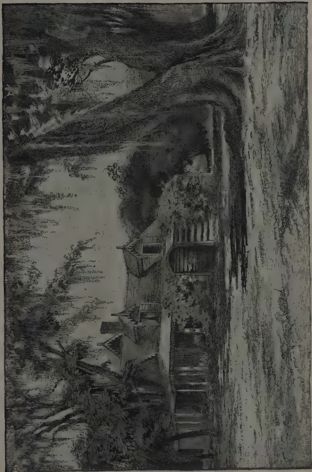
THE HOME AT MANDARIN, FLORIDA.