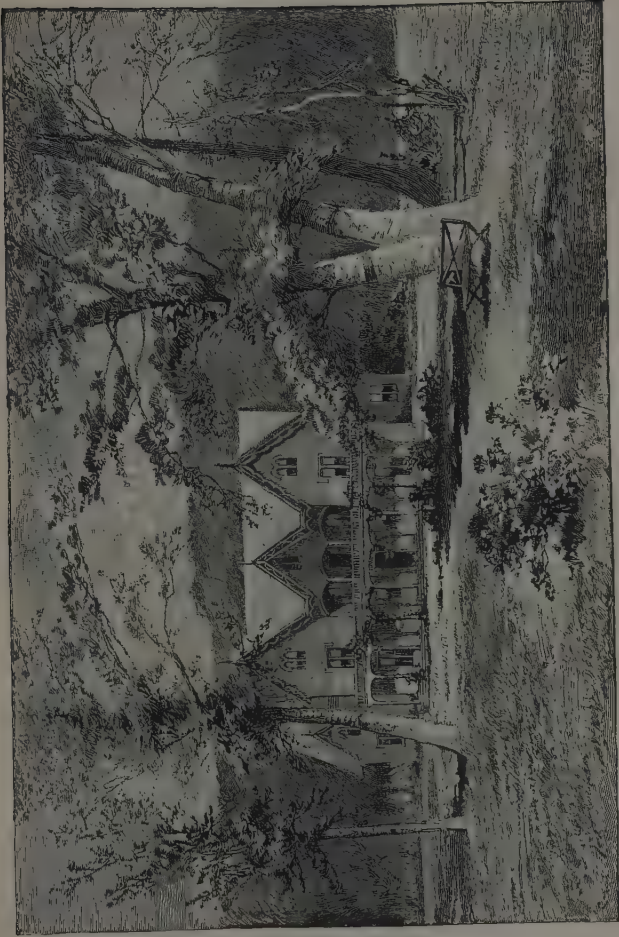
THE OLD HOME AT HARTFORD.