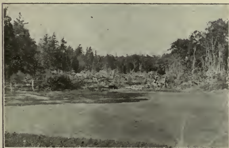
T HIRTEENTH green on Victoria, B.C., golf course being completed on H. B. C. land. At first it was like the scene at the left.