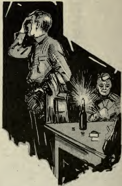
Somehow, trembling, he struggled to his feet.

The words came to the distressed young man's ears as words from a distance; the walls began to go round and the floor to rise. Somehow,