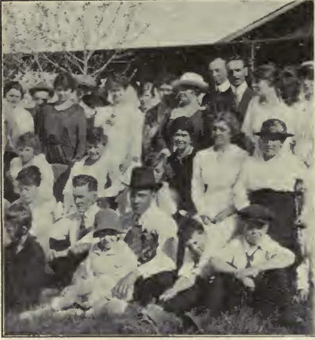
An out-of-season photograph of a merry group of H.B.C. Lethbridge employees, reminiscent of the "good old summertime."