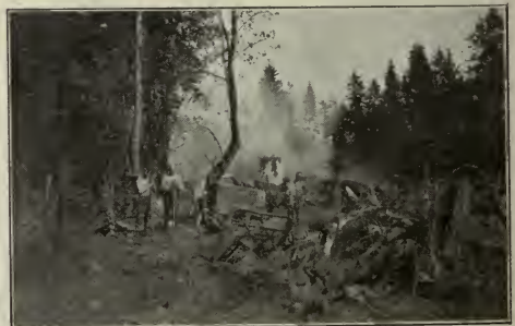
H EAVY work clearing H. B. C. land on Vancouver Island which will be used for a golf course by Victoria residents next summer.