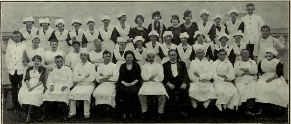
The Chef and Staff of the already famous "Victorian" Restaurant.

The spirit of those boys augurs well for the coming year.