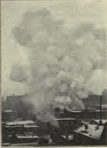
Fire in Old H. B. C. Building