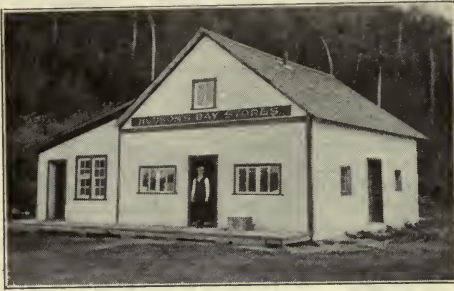
H.B.C. Store at Fort McMurray, Alberta