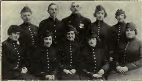
PICTURING a group of H.B.C. Vancouver store elevator operators, with the starter and sentry.

These young ladies have more "ups and downs in life" than others, yet withal preserve an equanimity and amiability throughout the day that has endeared them to their fellow employees and added much to the popularity of the store.