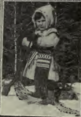
THE "LITTLE TRAPPER" WEARS A WARM COAT MADE FROM A 4-POINT BLANKET

NONE GENUINE WITHOUT THE SEAL OF QUALITY.