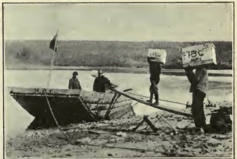
CARRYING supplies aboard an H.B.C. flatboat or scow on the Athabasca River. The scow has remained one of the principal links in the Company's chain of transportation in this district where tumbling waters make steam or motor boat operation precarious.

The Factor's private office was at the right, and the parlour or sitting-