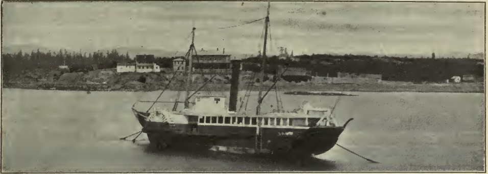
The "Beaver" Riding at Anchor Near Victoria