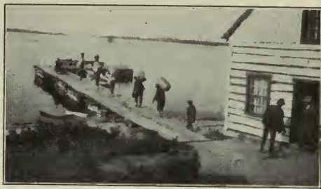
LOADING the boats at an H.B.C. inland post. The start of a long journey to the great auction market in London.

On account of the fact that practically all the business of Canada is transacted through its banks, the Canadian Banking System enjoys a unique position compared with the systems of other countries, and accordingly the statement of the Chartered Banks of