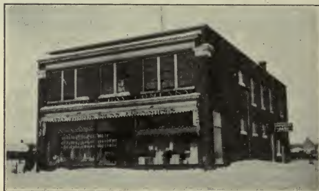
H.B.C. Store, Sioux Lookout, Ont.

GRAHAM is one of the comparatively small number of H.B.C. "line" posts, i.e. , fur trading establishments located close to railway transportation. Graham Post is on the Canadian National Railway at Sioux Lookout, a town of nearly one thousand people and a railroad and lumbering centre.