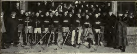
Left to Right, Front Row, Officials and Team: